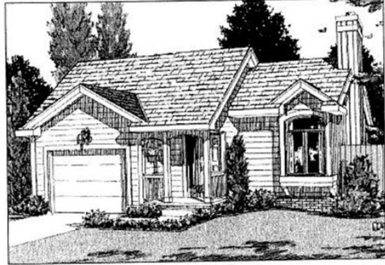
Front Elevation Artwork

20 x 15 Great Room with Cathedral Ceiling